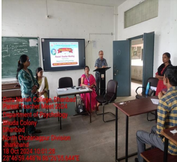
Guru Nanak College, Dhanbad Parent Teacher Meet 2024 Department of Psychology Bhuda Colony Dhanbad North Chotanagpur Division Jharkhand 18 Oct 2024 10:01:28 23°46'59.448"N 86°26'55.644"E