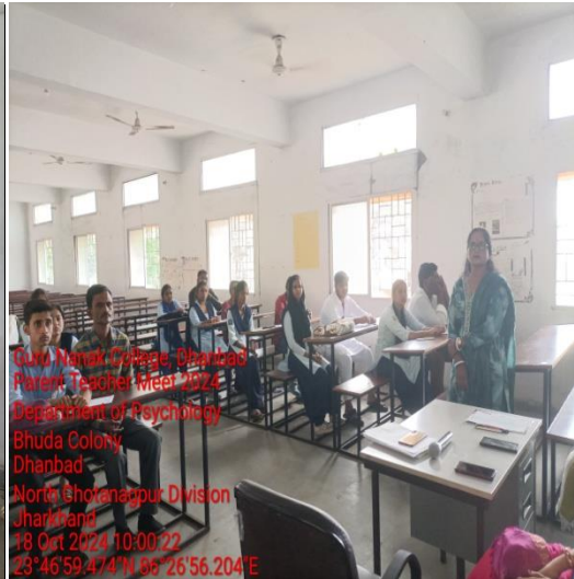
Guru Nanak College, Dhanbad Parent Teacher Meet 2024 Department of Psychology Bhuda Colony Dhanbad North Chotanagpur Division Jharkhand 18 Oct 2024 10:00:22 23°46'59.474"N 86°26'56.204"E